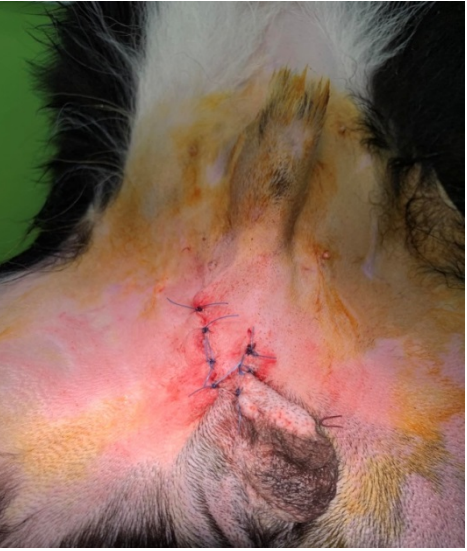
Figure 3 The appearance of the surgical wound after suturing the skin in inguinal cryptorchidism

In the case of bilateral cryptorchidism, the incision was placed medially. In this case, the foreskin was first removed from the abdominal wall and moved laterally, after which an incision was made along the white line of the abdominal wall. After visualization of the suspicious testicle, a double ligation of the spermatic cord and removal of the remaining testicle was performed. The spermatic cord was ligated with absorbable multifilament suture PGA, USP 0 or 2/0 (Yavo,