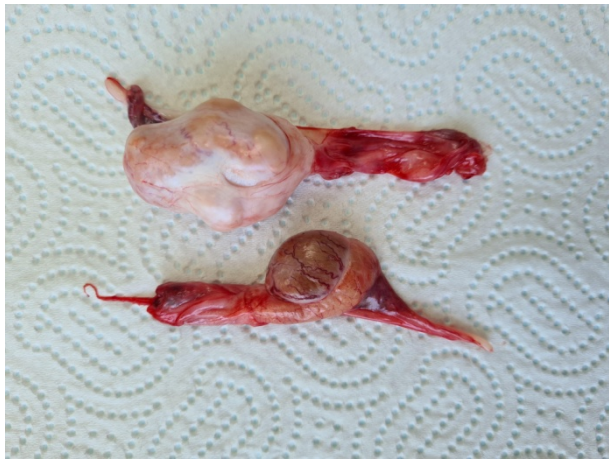
Figure 5 Morphologically altered testicle-above; Morphologically unchanged testicledown

After removal of residual testicles, each removed testicle was sent for pathohistological examination. Out of a total of ten dogs, one dog was diagnosed with a residual testicular tumor in the seminoma type (unilateral inguinal cryptorchid) (Figure 5, 6), while the others were diagnosed with testicular atrophy (Figure 7).