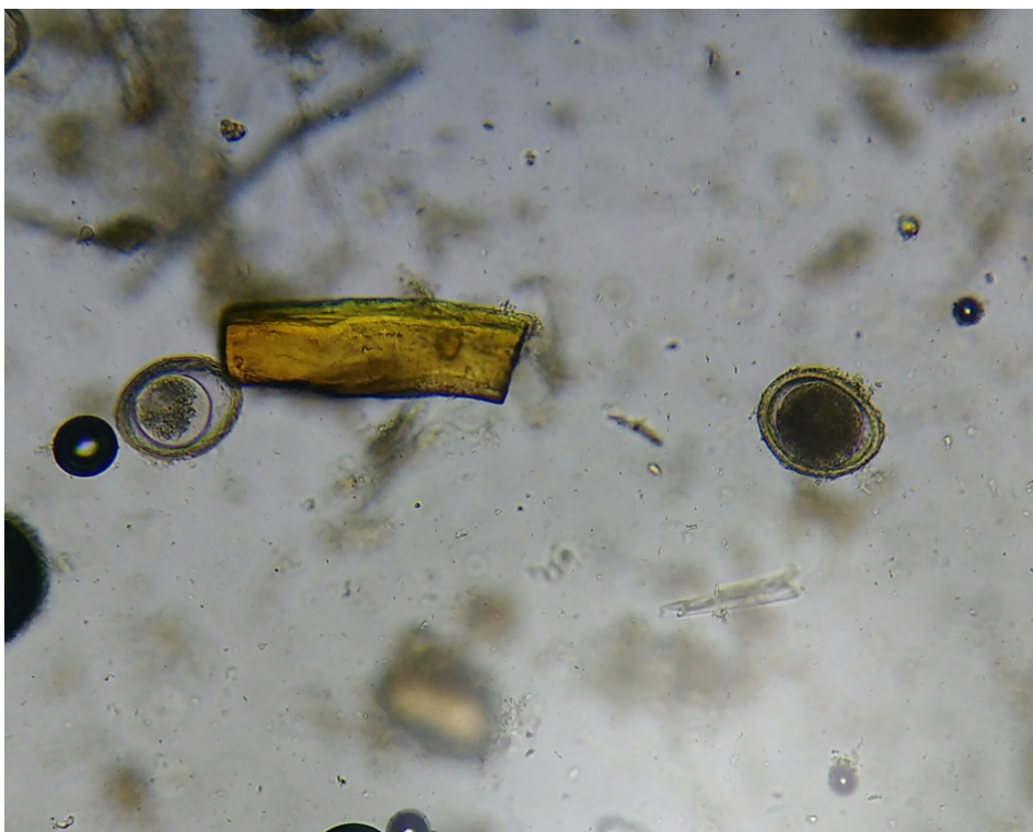
Figure 2: Morphological characteristics of nematode eggs - left Toxascaris leonina , right Toxocara canis , 200x

was carried out after 2 hours. After macroscopic examination, fecal samples were examined using saturated zinc sulfate solution flotation technique (1.30-1.40). Minimum 3 grams of feces was homogenized with 40-50 ml of flotation liquid, filtered into a pure plastic glass and the sample was transferred to two 15 ml tubes, on top of which there were cover glasses. After 20 minutes of flotation, the cover glass was carefully shifted to the cover slip and examined microscopically at a magnification of 10x. Coprological diagnosis was based on the structure and size of the concentrated parasitic elements: eggs and larvae (Monnig, 1950) (Fig. 2).